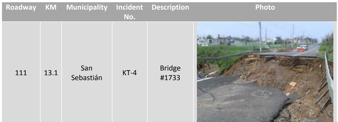
Figure 1: Example of an incident-record, identified using Linear Referencing System (LRS)

For more events, see www.gis.fhwa.dot.gov/events.asp