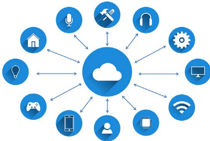
Figure 3: Figure depicting the interrelation of everyday objects connected to the internet

between physical devices, vehicles, trains, planes, buildings, streets, and other items embedded with electronics, software, sensors, actuators, and connectivity. Any discussion of IoT in the context of GIS for transportation involves the issue of spatio-temporal data representation and storage . The preferred option for IoT data analytics is the cloud (e.g., geospatial Python), far different from current practices of storing geospatial data (e.g., ESRI shapefile, GeoJSON formats along with relational database such as PostGIS).